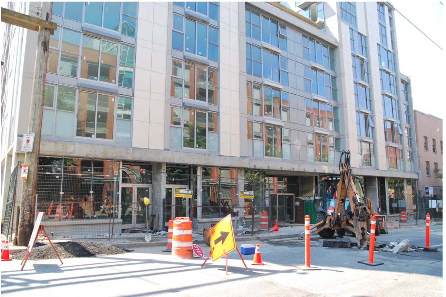
Powell Street – Front View