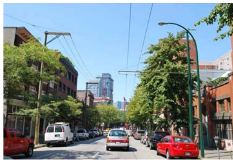
Powell Street View