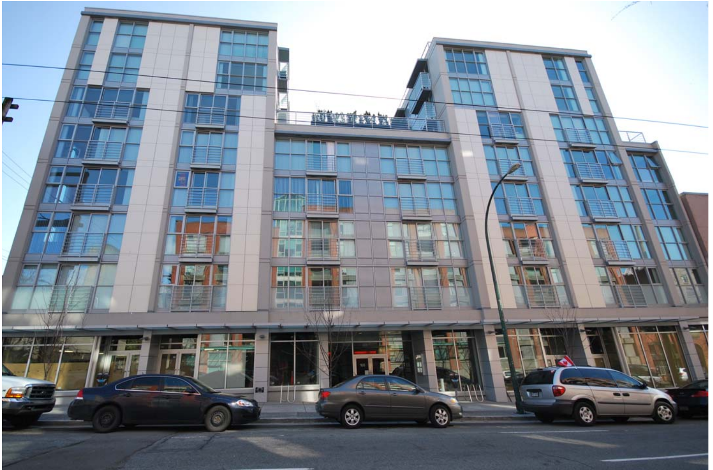
Powell Street – Front View