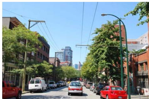
Powell Street View