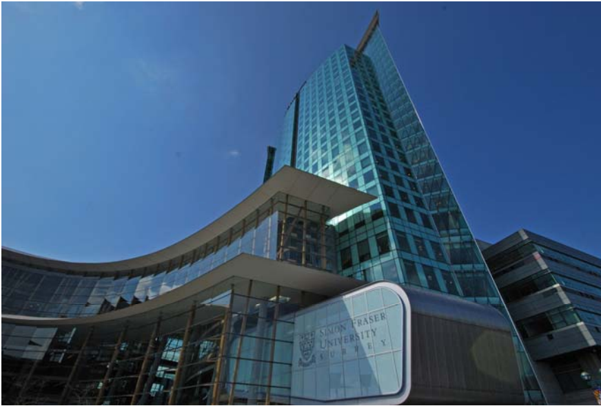
Simon Fraser University