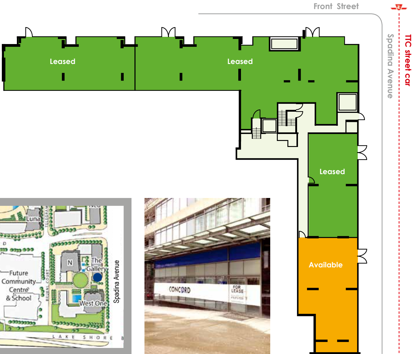
N/ The Gallery