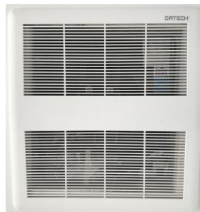
Typical bathroom/ensuite exhaust fan

NOTE: This system exceeds City Code that states you must run your fan for a MINIMUM of two, 4-hour operating periods per day to remove excess moisture from the air and aid in maintaining a healthy home by daily exchanging the ambient air in the suite.