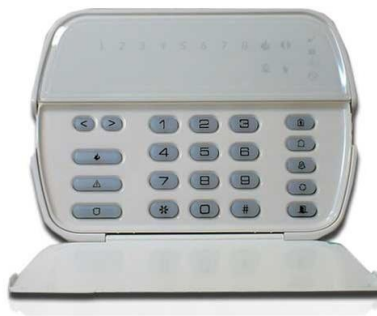
Model: DSC PK5500 Alarm Keypad

NOTE: Restoring your personal security codes is not a warranty issue.