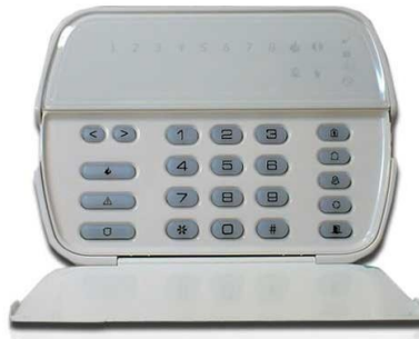
Model: DSC PC1616 control panels with the DSC RFK5501 keypad

NOTE: Restoring your security codes is not a warranty issue.