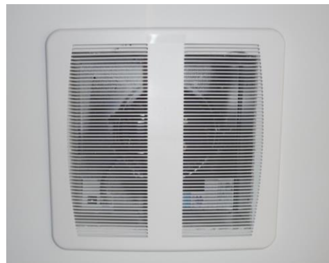
Typical Bathroom Fan