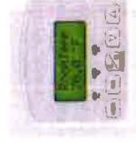
Fig. 12 Commercial models with Override