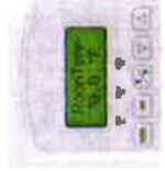
Fig. 11 – Hotel models *1,2,F