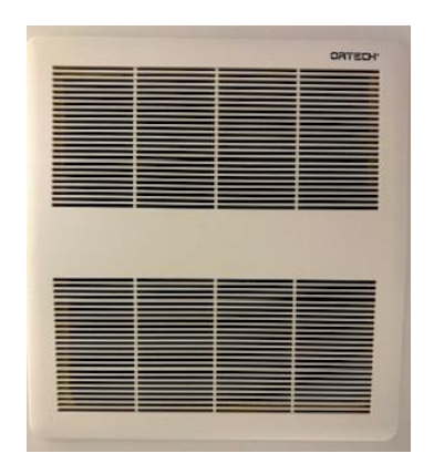
Typical Bathroom Fan

NOTE: Surrey City Code requires the fan to run 24/7 at low speed.